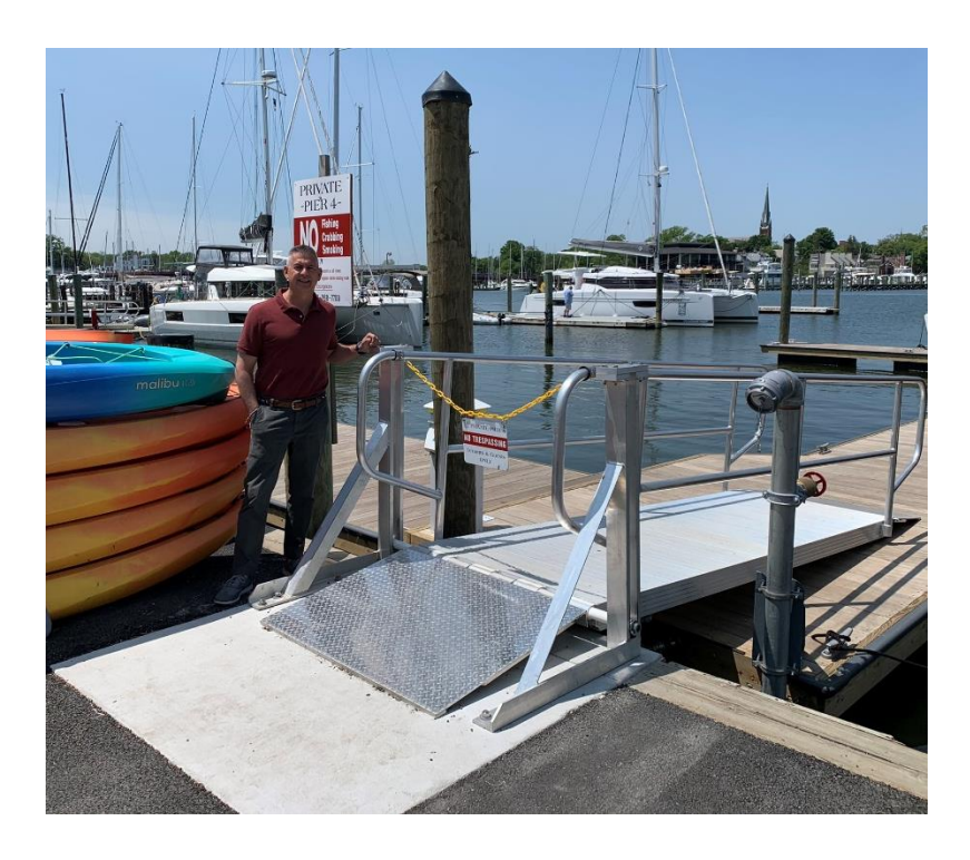
A view of the innovative levitating gangway and high pilings.