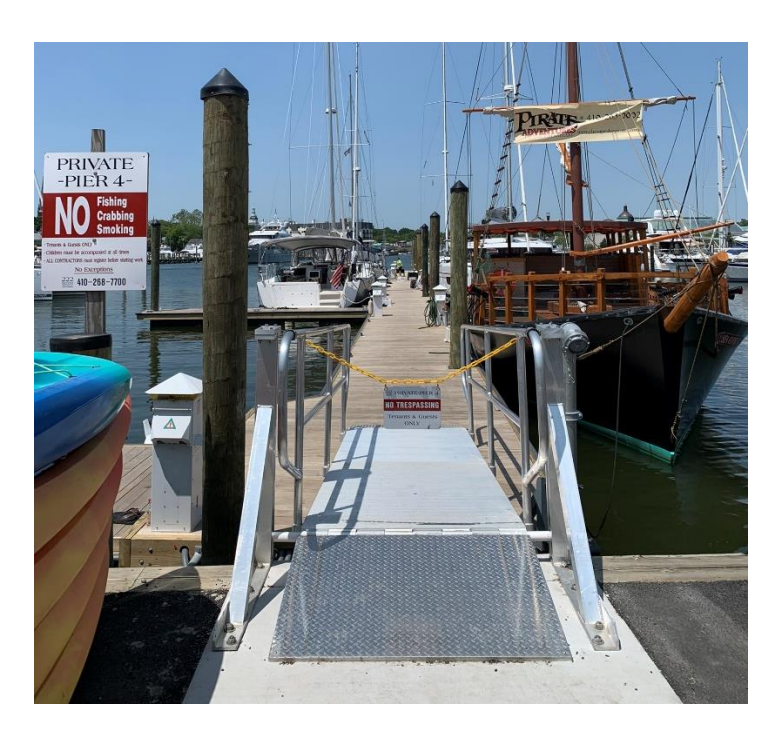
A view of 222 Severn's new innovative pier with levitating gangway and extra tall pilings shown.

222 SEVERN AVENUE • ANNAPOLIS, MARYLAND 21403 • TEL: 410-268-7700 • FAX: 410-268-7750